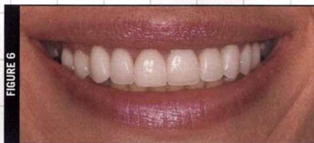
FIGURE 6 Postoperative aesthetics following placement of porcelain restorations achieved the expectations of the patient.