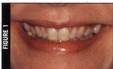
FIGURE 1 Preoperative evaluation indicated short clinical crowns, slight discoloration, and misaligned dentition.

Porcelain laminate veneers have revolutionized aesthetic dentistry, allowing the delivery of natural-looking restorations with minimal tooth reduction. Veneers can be used to mask severely discolored substructures while maintaining natural translucency and light transmission. These restorations can be used to literally transform a patient's smile, enhancing his or her overall appearance and sense of self worth.