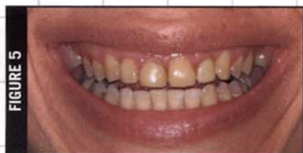
FIGURE 5 The patient was dissatisfied with her preoperative appearance and desired a brighter, more uniform smile.