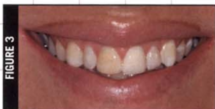
FIGURE 3 Preoperative smile demonstrates slight discoloration and rotation of the lateral incisors.