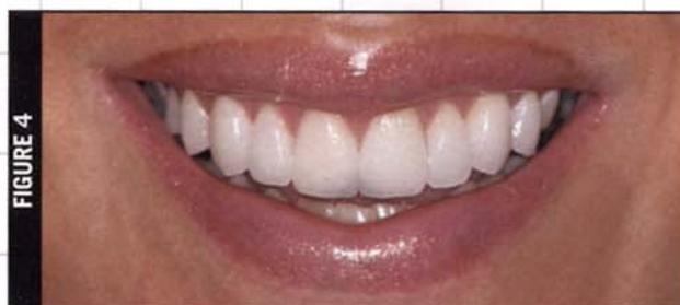
FIGURE 4 Patient satisfaction with the postoperative results was achieved following treatment with all-ceramic restorations to achieve a whiter, brighter appearance.