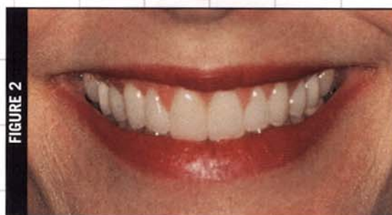
FIGURE 2 Postoperative appearance following restoration using porcelain laminate veneers demonstrates improved aesthetics and an enhanced smile.